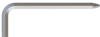
B. ALLEN WRENCH